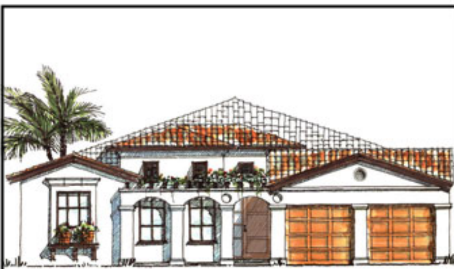
Classic Bahama Elevation.